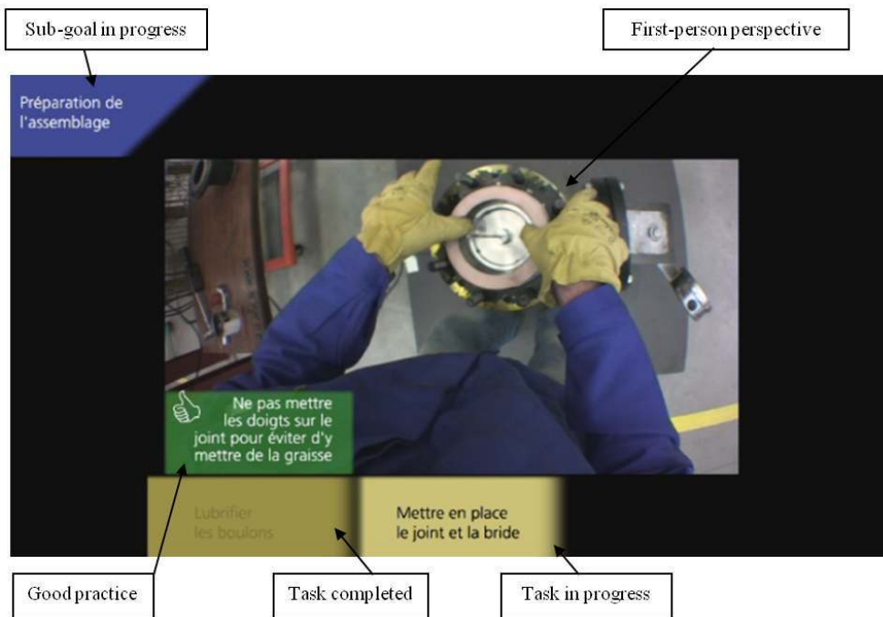
Figure 1. Sample of the corpus of professional gestures studied here

Capture screens from : (A) PG1 : Remotely operating a tap. (B) PG2 : Manually setting a tap. (C) PG3 : Diagnosing a dysfunctional electronic valve. (D) PG4 : Diagnosing valve failure. (E) PG5 : Controlling valve tightness. (F) PG6 : Closing a condenser. (G) PG7 : Consigning a pump. (H) PG8 : Completing safety operator rounds. (I) PG9 : Tightening a bolted assembly. (J) PG10 : Inverting a charger.