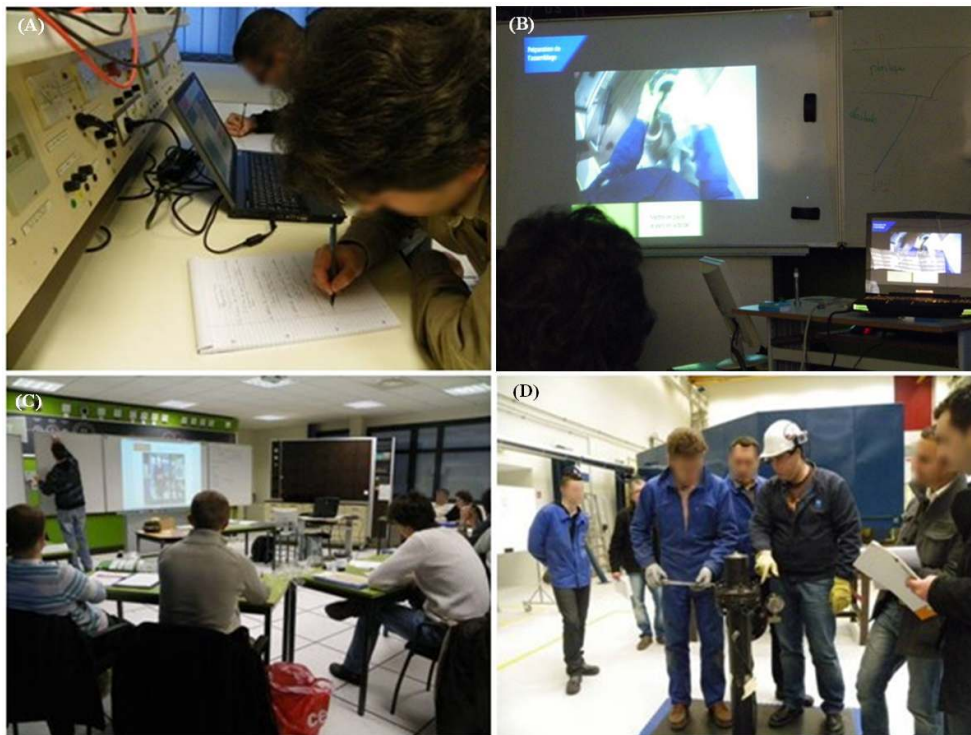
Figure 2. The goal tree model

An example of how our adaptation of the Activity Theory model was applied to a professional gesture PG1. Remotely operating a tap (figure 1A).