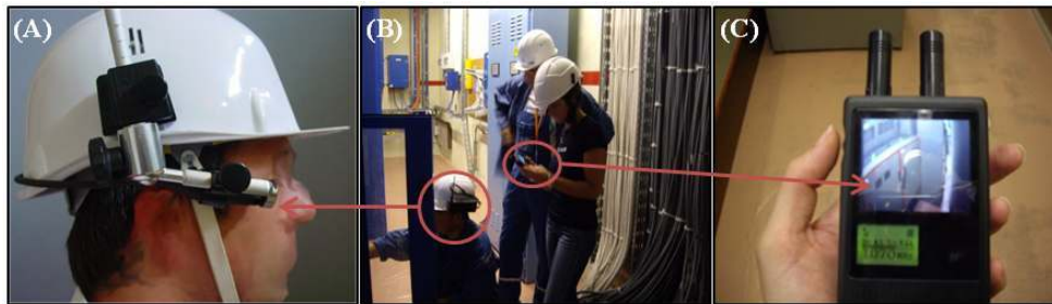
Figure 4. High-definition subcam attached to a hard helmet with its remote monitoring screen

(subjective camera) (Lahlou, 1998), a small digital camera designed to be worn at eye-level by the subject performing the activity.